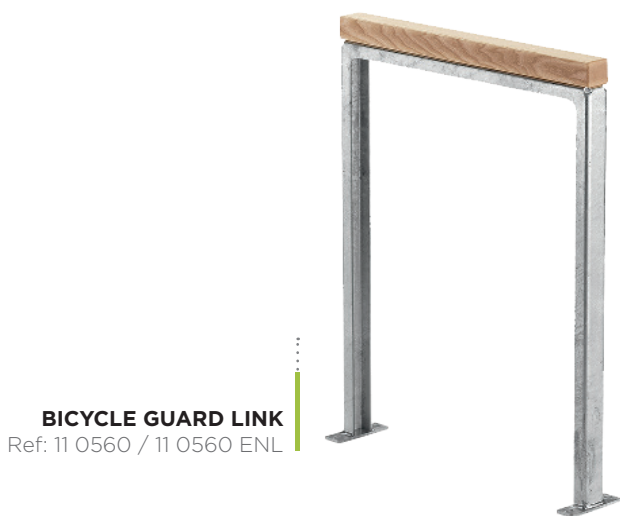
BICYCLE GUARD LINK Ref: 11 0560 / 11 0560 ENL