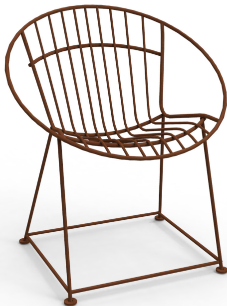
ALIYOU ARMCHAIR Ref: 13 6015