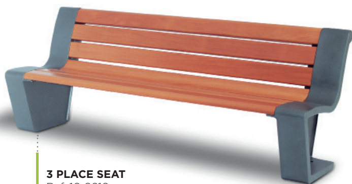
3 PLACE SEAT Ref. 10 0210