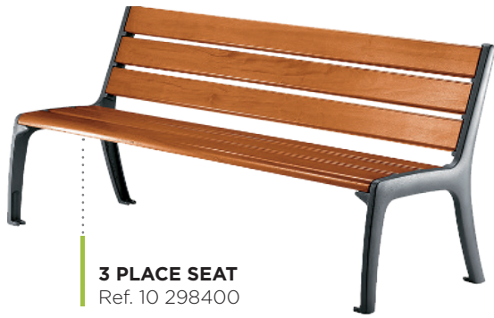
3 PLACE SEAT Ref. 10 298400