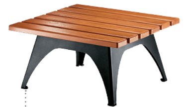
LOW TABLE Ref. 10 0640