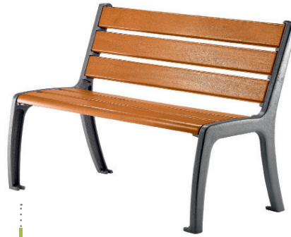
2 PLACE SEAT Ref. 10 298402