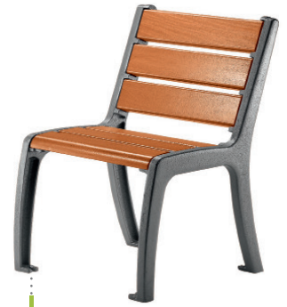
CHAIR Ref. 10 298405