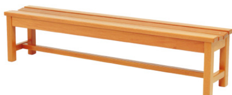
BENCH Ref. 10 0806