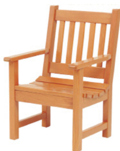
ARMCHAIR Ref. 10 0804