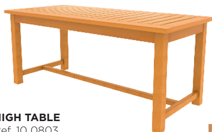
HIGH TABLE Ref. 10 0803