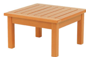
LOW TABLE Ref. 10 0805