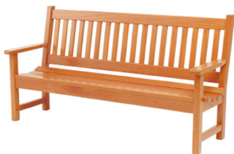
3 PLACE SEAT Ref. 10 0802