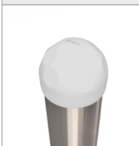
PLATE AND ROPE CONNECTORS MADE OF INJECTION MOLDED POLYAMIDE

SAFE PIPE PLUGS MADE OF INJECTION MOLDED POLYAMIDE