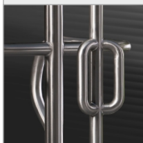
PLATE MADE OF ANODIZED ALUMINIUM PLACED OF A HANDLE MADE OF POLYAMIDE

PLATES MADE OF COLOURFUL TRIPLE LAYERED POLYETHYLENE HDPE 15 MM