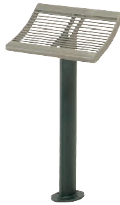
SINGLE PERCH SEAT Ref. 12 3101