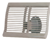
SIMPLE BACKREST Ref. 12 3101