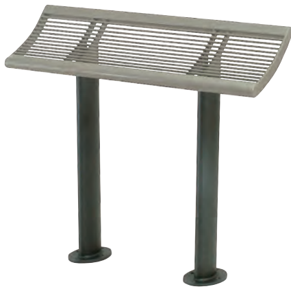
DOUBLE PERCH SEAT Ref. 12 3102