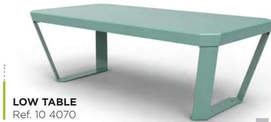
LOW TABLE Ref. 10 4070