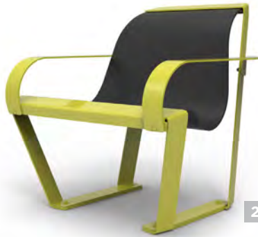
ARMCHAIR Ref. 10 4015