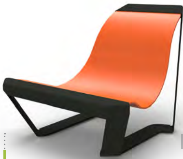
CHAIR Ref. 10 4010